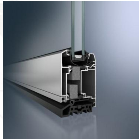
Schüco ADS 70 RL.HI (Residential Line)