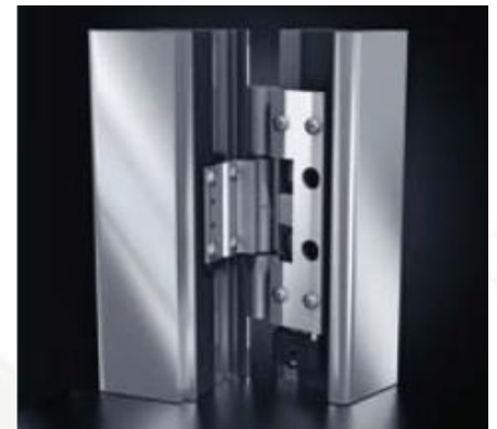
Cylindrical hinges for Schüco ADS HD